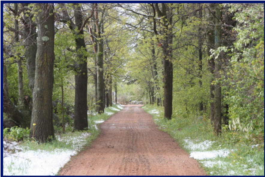
A path leading into the Hans Schabel Woodlands.