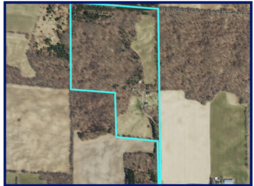
The landcover of the Hans Schabel Woodlands. This property is 50 acres total and showcases high diversity in vegetation.